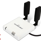
6300-CX LTE ROUTER